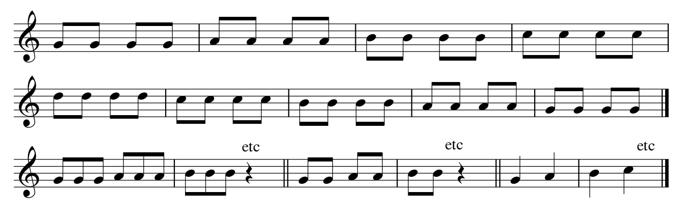
Read the note letter names of each tune. Clap and say the rhythm, either

Play each note 4 times; then 3 times, 2 times and finally as a single note scale